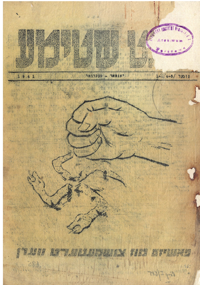
The slogan “Fascism must be crushed” on the cover of Yugt Shtime (Voice of the Young) from January/February 1941, published by Tsukunft, a Bundist youth movement.

imperialistic conflict, which therefore raised the question of whether the working class should participate in it, as both sides of the conflict had no intention of fulfilling political goals of the Jewish left. 34 Was remaining politically neutral even an option? What might come as a surprise today is that picking sides was not so obvious for some Jewish activists.