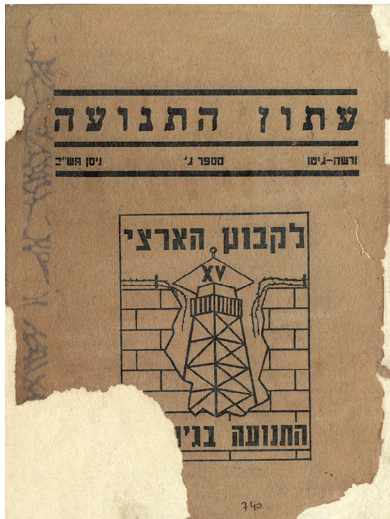
The front cover of the third issue of Iton Hatnua (Newspaper of the Movement), published by Hashomer Hatsair in March/April 1942. The illustration depicts a watchtower visible through a breach in the ghetto wall, which is covered in broken barbed wire. The inscriptions in Hebrew read "Towards Kibbutz Artzi" on top and "Movement in the Ghetto" on the bottom. (AŻIH, ARG I 1307)